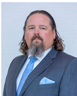
Hon. JR Woolley Justice of the Peace Waller County